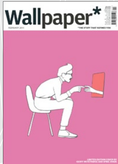
LIMITED-EDITION SUBSCRIBER COVER BY GEOFF MCFETRIDGE AND SPIKE JONZE, INSPIRED BY JONZE'S NEW FILM, HER.